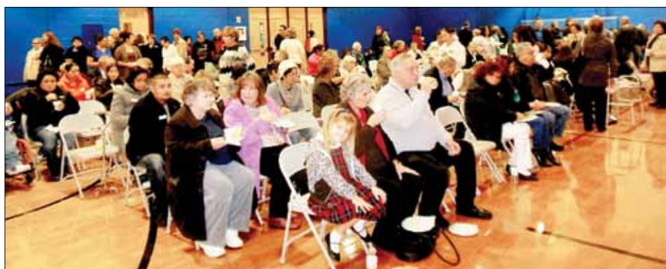
On Nov. 1, Our Lady of Good Counsel School in Aurora hosted their annual Grandparents' Day for more than 125 guests.