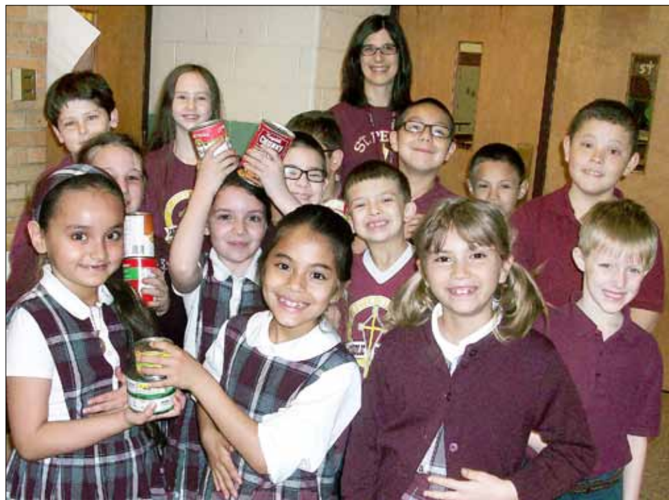
Aurora’s post office sponsored a food drive the first weekend of May. The second graders of St. Peter School in Aurora collected four well filled boxes of non-perishable food items to help with the cause.