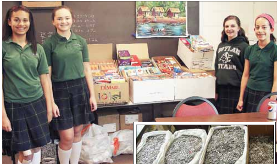
In Loves Park, the St. Bridget School Builders Club sponsored a collection of kid-friendly snacks (above) for the Rock House Kids of Rockford. They also collected pop tabs (insert) all year for Ronald McDonald House.