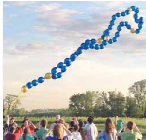
At St. Mary Parish in Huntley, the junior high youth ministry assembled, prayed and set free a balloon rosary to honor the Blessed Virgin Mary in the month of May

After telling other parables, Jesus later went to a house where he could be alone with his disciples. Even they wondered about the meaning of the stories Jesus had told that day. So Jesus tried to explain it to them: “He who sows the good seed is the Son of Man, the field is the world, the good seed the children of the kingdom. The weeds are the children of the evil one.”