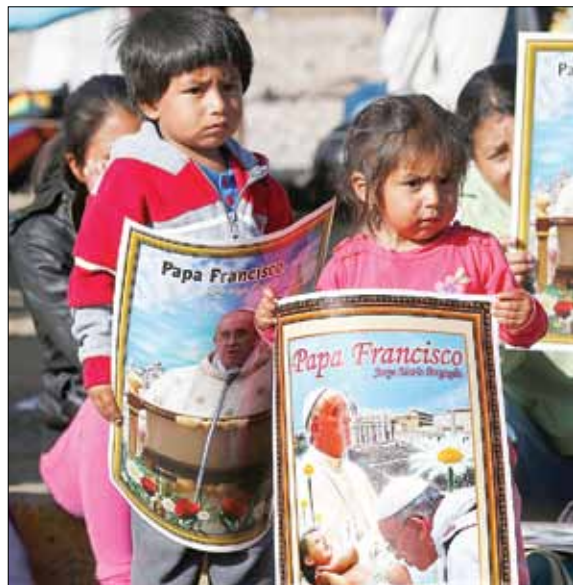
Children hold posters as they wait to see Pope Francis near his meeting with clergy, religious men and women, and seminarians at the El Quinche National Marian Shrine in Quito, Ecuador, July 8.