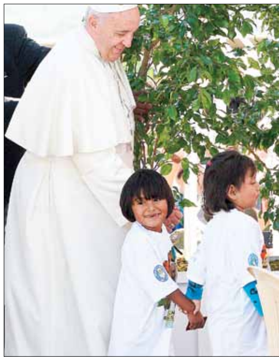
Pope Francis walks with children of prisoners in Santa Cruz, Bolivia, July 10.

I was wondering what the Lord meant by that when a hand appeared in the air in front of me. It was holding a scroll. The scroll unrolled, and I could see it was covered with writing. So I ate the scroll, and it tasted like honey.