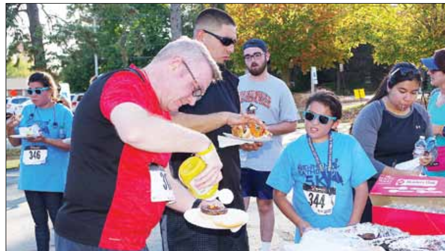
A diner tops his sandwich with his favorite condiments.