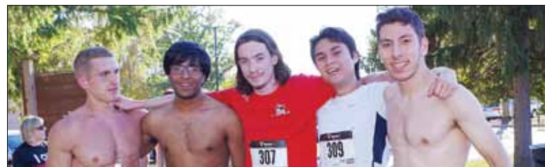
After being first across the finish line, five racers relax.