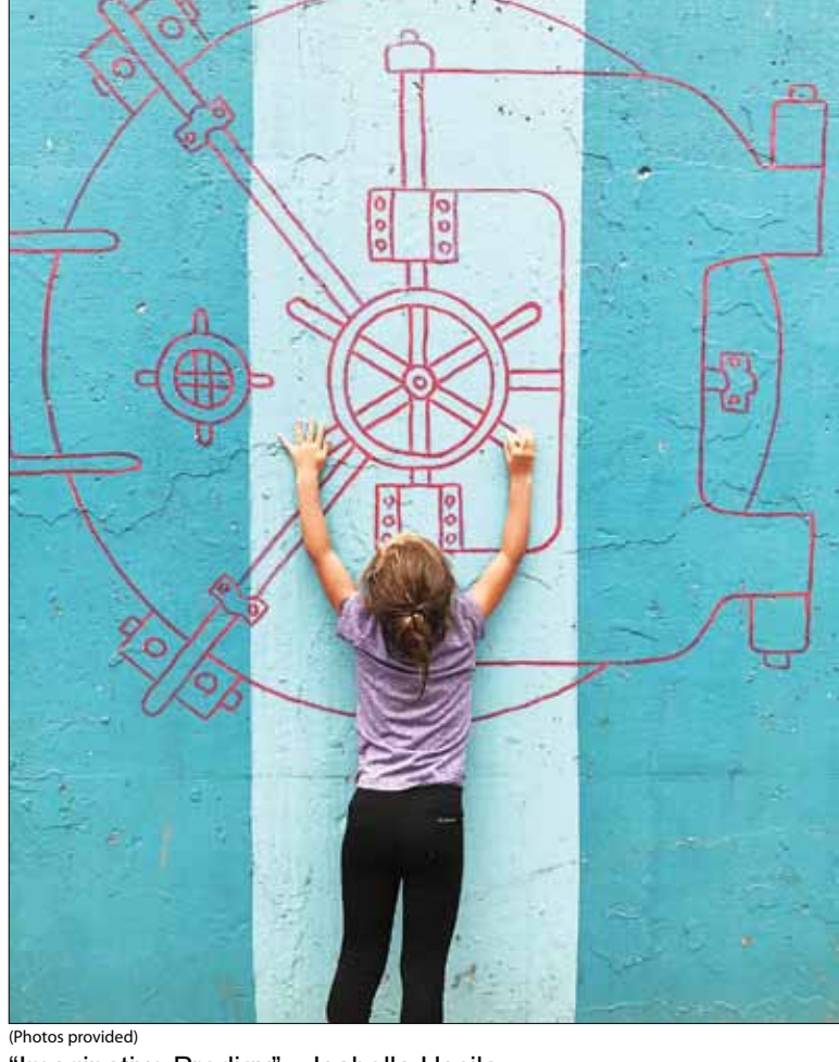
"Imaginative Prodigy" - Isabella Uscila

The 10-week contest produced 10 winners each week. The 100 top photos were displayed from 6-8 p.m., Dec. 14. at Waterstreet Sudios