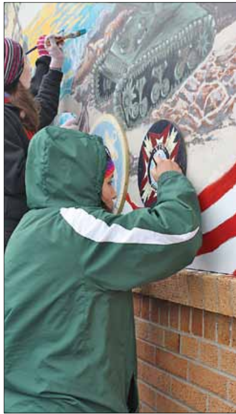
A student touches up a VFW logo on the mural at Post 1461 in Belvidere.