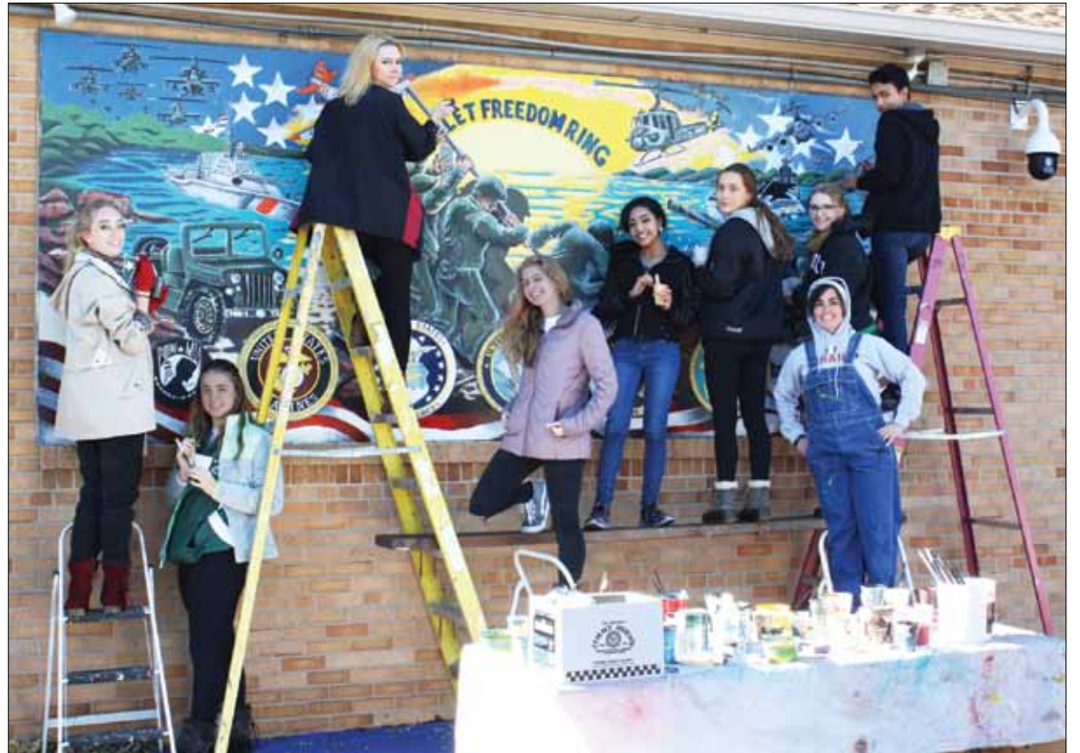
Student artists from Boylan Central Catholic High School in Rockford pose for a photo.