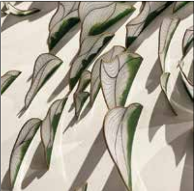
Week 8, Bella Williams “Fins,” 10th place