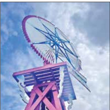
Week 1, Evelyn Sauer “Red Windmill,” 10th place