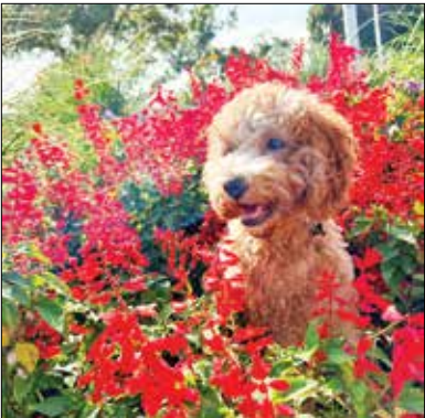
Week 2, David Brol “Pup in Red Flowers,” 10th place