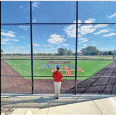
Week 7, Clay Ellis-Escobar “School Spirit,” 9th place