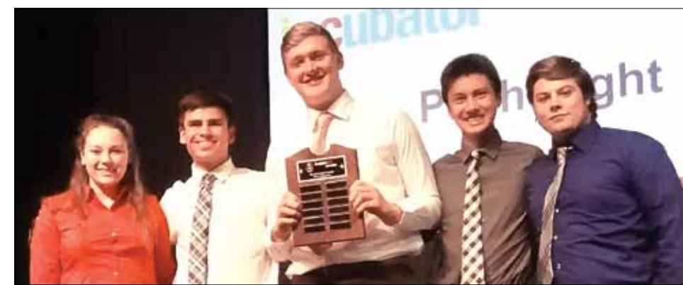
Dorm Drop, creators of care packages for college students, took first place.