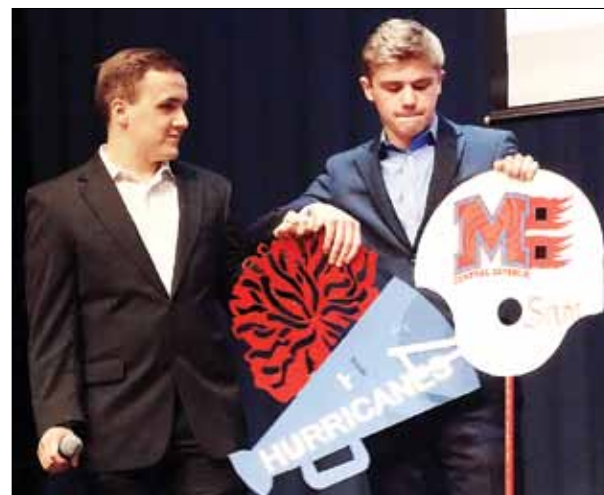
Members of the Athletic Sign Source team show some of their prototypes during their pitch.

At Marian, though, "We realized it was very unrealistic for four high school students to create a bakery especially since three of my team members