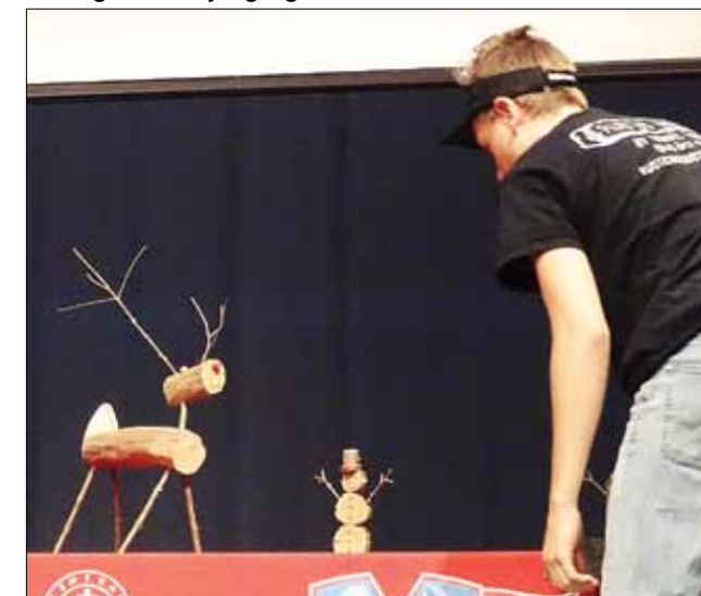
A Rustic Woods team member sets up samples of their woodcrafts for their pitch. The team also had matching Rustic Woods t-shirts, which they wore to make their pitch.